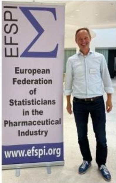
EFSPI President 2024–2025