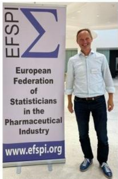
EFSPI President 2024–2025