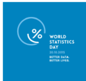
The logo for World Statistics Day 2015.

On October 20 this year, the global statistical community will showcase their achievements and their ongoing work to help this vision come true as part of World Statistics Day 2015 .