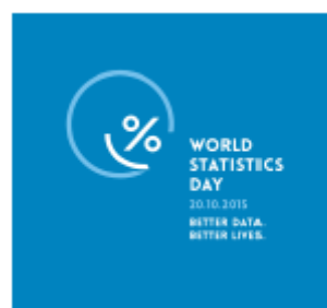
The logo for World Statistics Day 2015.

On October 20 this year, the global statistical community will showcase their achievements and their ongoing work to help this vision come true as part of World Statistics Day 2015 .