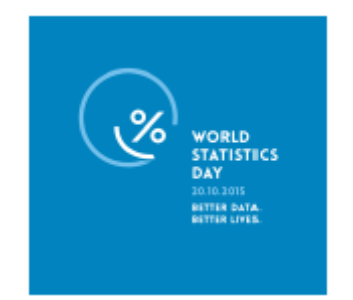
The logo for World Statistics Day 2015.

On October 20 this year, the global statistical community will showcase their achievements and their ongoing work to help this vision come true as part of World Statistics Day 2015 .